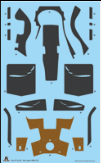
Sheet B: Composite materials